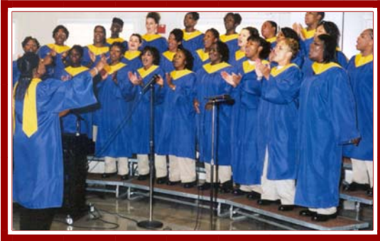
Pulaski State Prison Women's

To reduce recidivism through utilization of faith-based partnerships that will support the offender's successful transition from custody into the community.