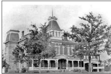
Ponder Hall was built in 1895.

over again but had no building, no teachers and no students.